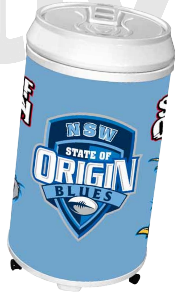
Product Code: M3CCR-SON