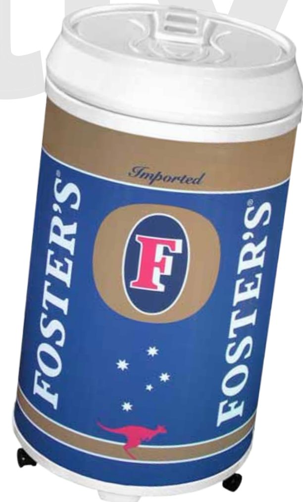
Product Code: M3CCR-BFD