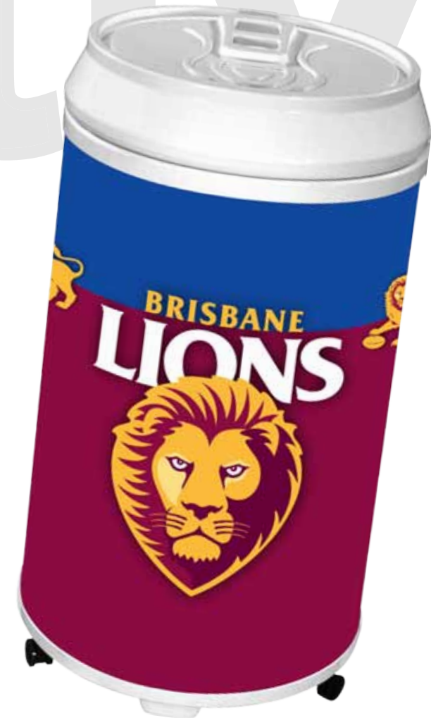
Product Code: M3CCR-ABL